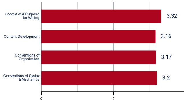
Fig. 2: Late-Career Communication Scores (n=364)