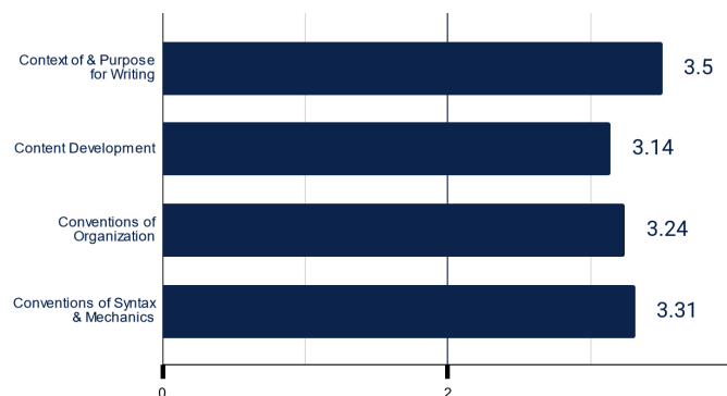
Fig. 1: Early-Career Communication Scores (n=364)